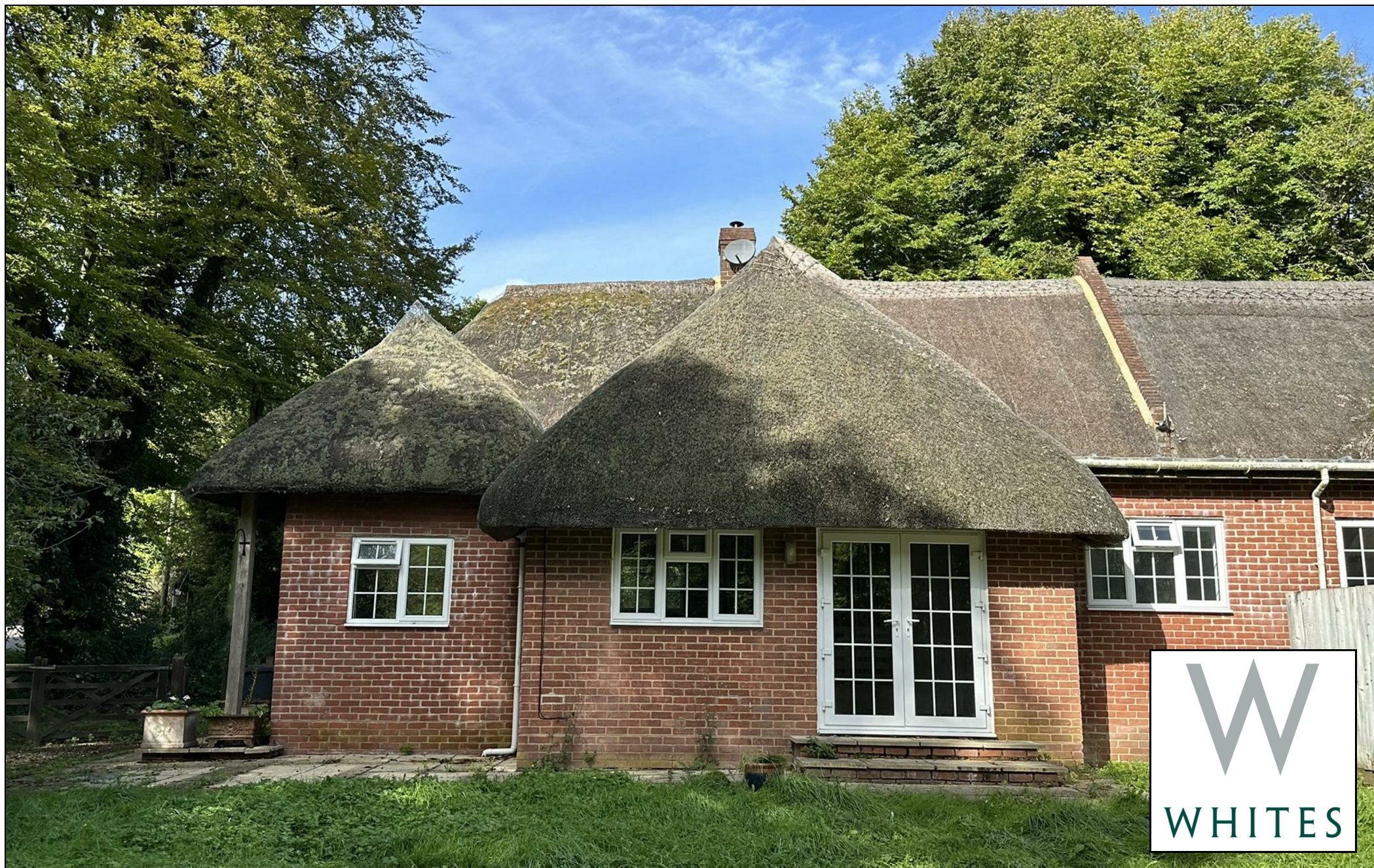
2 Vine Cottages, Handley Street, Ebbesbourne Wake, Salisbury, Wiltshire, SP5 5JG